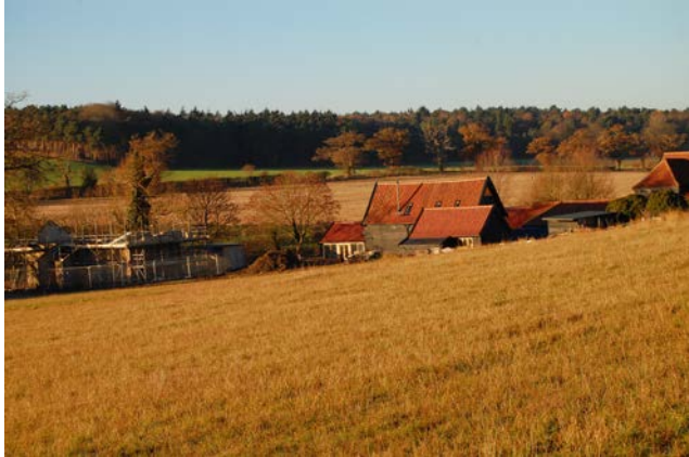
Work on barn conversion at Vicarage Farm

December: New access and drive to Vicarage Farm