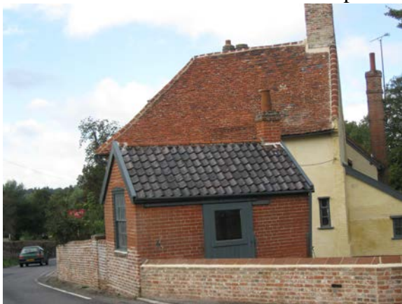
Manor Farm House

Manor Farmhouse refurbishment completed and property sold subject to contract.